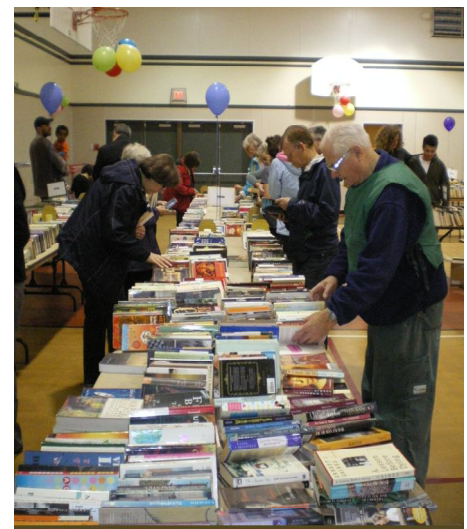
Friends of the Library BookFest 2010

As always, I want to thank the staff, board, volunteers and Friends. Without these tireless workers and library advocates, Bowen Library would not grow and flourish as it has.