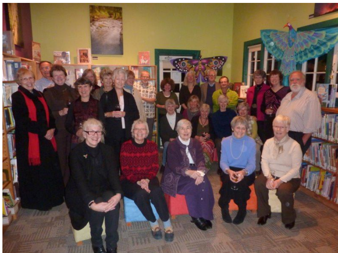
A few of our board, volunteers and Friends in the newly remodeled children's area