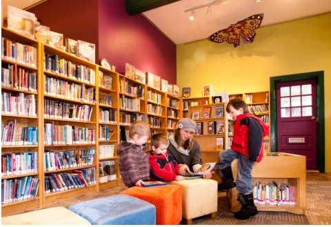
Newly remodeled children's area

The Bowen Library received an interior face lift in 2010 courtesy of the Friends of the Bowen Island Public Library. The Friends generously donated $15,000 for new furnishings, shelving and lighting, as well as painting and decorating in the lounge and the children's area. The new study tables and chairs are well used and the children's area is now a brightly coloured corner with new display shelving and soft furnishings for little readers and their adult companions. The remodeling will continue in 2011 with additional display area for the adult collections and further redecorating of the lounge and study areas. Many thanks go to the Friends for their donation and for their continued support of numerous library programs.